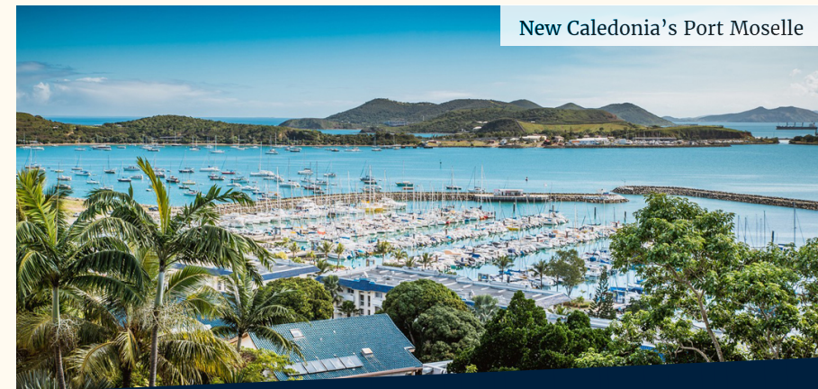
New Caledonia's Port Moselle