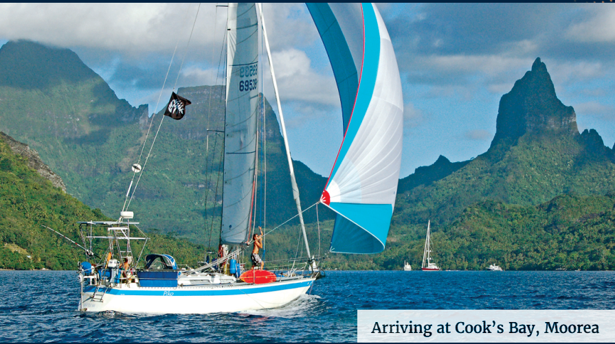
Arriving at Cook's Bay, Moorea

After setting sail from the West Coast of the Americas, the first landfall that most westbound sailors make is within the five archipelagoes of French Polynesia: the Marquesas, Tuamotus, Societies, Gambier and Australs. Although each region is geographically and culturally distinct, they all share similar threats to their natural ecosystems as populations of visitors and residents increase.